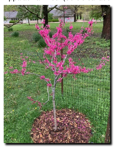
'Appalachian Red' (Cercis canadensis) You will pass a second 'Appalachian Red' shortly.