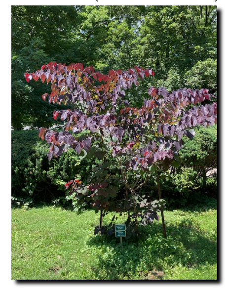
'Black Pearl' (Cercis canadensis)

From here, if you look outside the garden, across the split rail fence, you will find the final specimen.