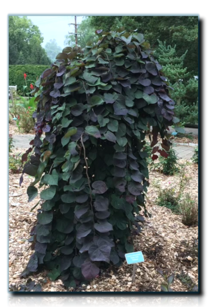
'Ruby Falls' (Cercis canadensis) is at the north end of the Backyard Garden.